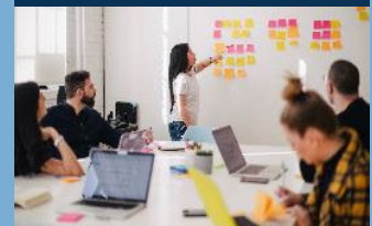
Career path for the future