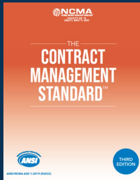
ANSI-accredited Contract Management Standard™ (CMS™)