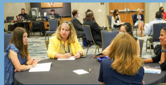
Talent and workforce mobility